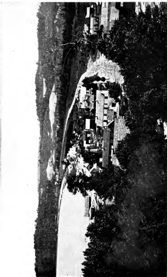
CRYSTAL LAKE AND BEULAH FROM BENZONIA